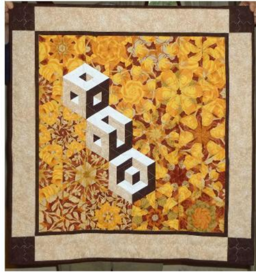
Above: Left over One Block Wonder Blocks plus hollow cubes.