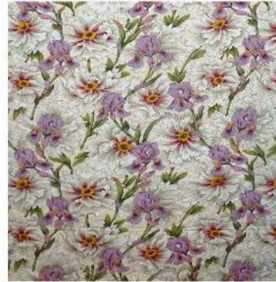
Above: Original Fabric