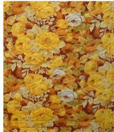
Above: Original Fabric