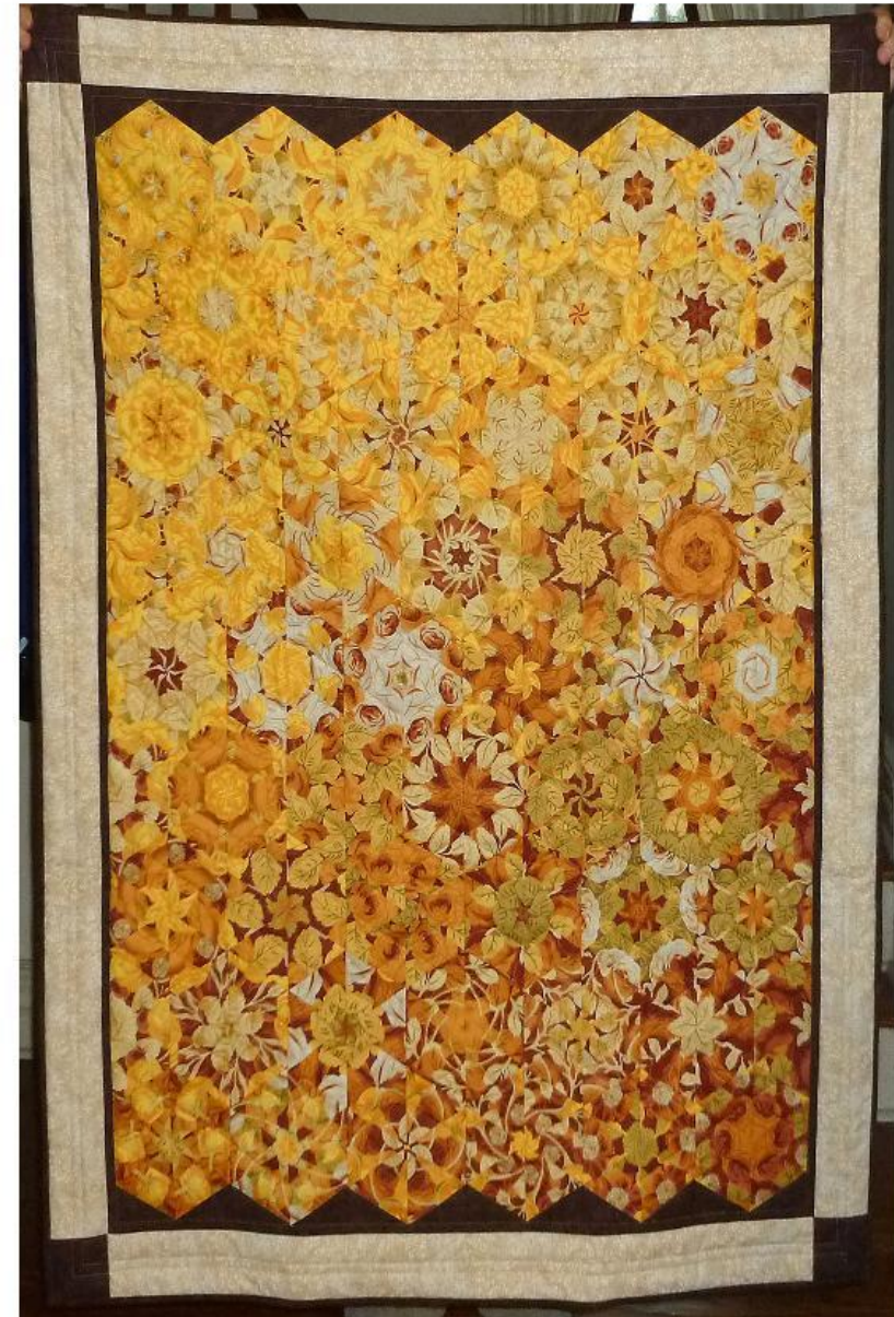
Right: Completed quilt.