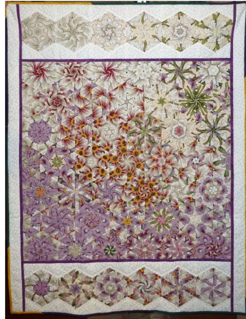
Right: Completed quilt.