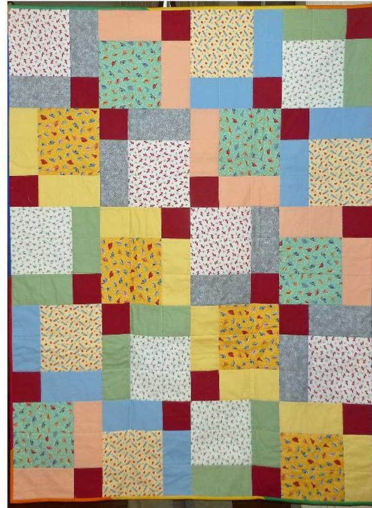
Right: VSQ Charity Day 2021 Disappearing Nine Patch.